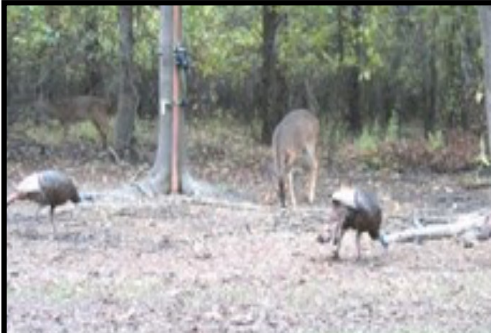
MOBILE Jerry's Stand 10/11/23 03:45 PM