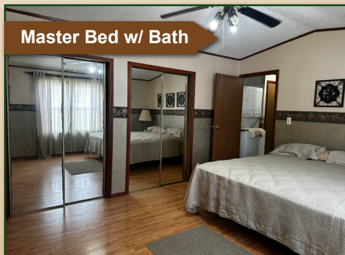
Master Bed w/ Bath