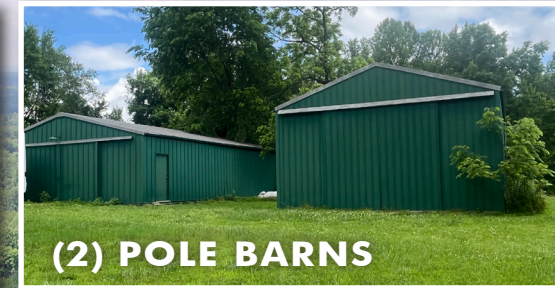
(2) POLE BARNs