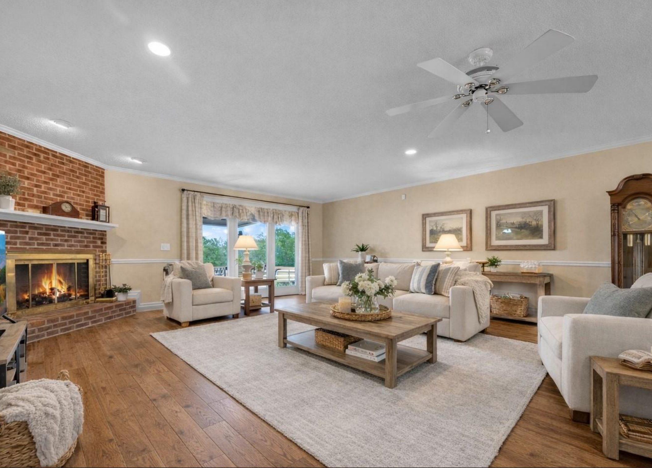
This photo has been virtually modified to demonstrate possible updates to the room.