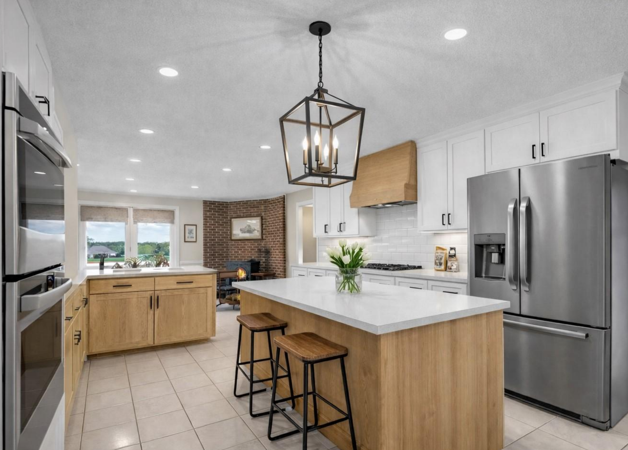
This photo has been virtually modified to demonstrate possible updates to the room.