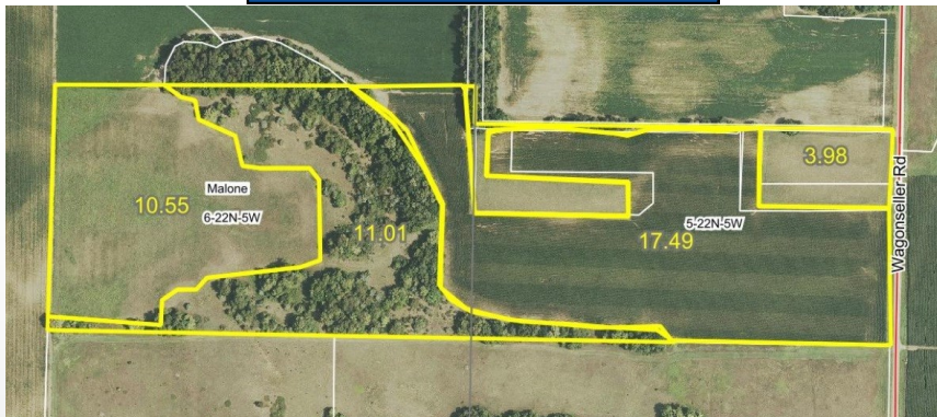
Tract 2 Soil PI 128.5 on tilled land.

FSA & Soils data provided by Agridata, Inc. Lines drawn are estimates.