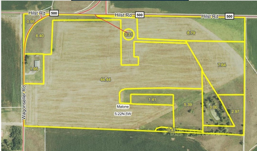
Tract 1 Soil PI 98.4 on tilled land