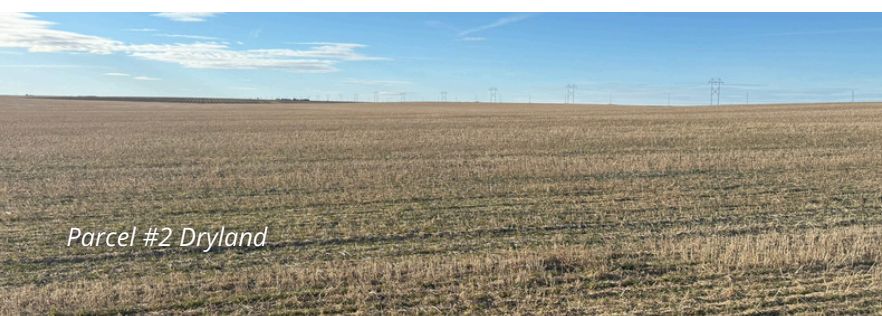
Parcel #2 Dryland

ONLINE BIDDING PROCEDURE: The Platner North Property will be offered for sale in 4 parcels with RESERVE. BIDDING WILL BE ONLINE ONLY. Bidding will begin @ 8:00 am MT on February 17, 2026. The auction will "soft close" @ 12:00 noon, MT on February 17, 2026. Bidding remains open on all parcels as long as there is continued bidding on any of the parcels. Bidding will close when 5 minutes have passed with no new bids. Bidders may bid on any and/or all parcels at any time before bidding closes.