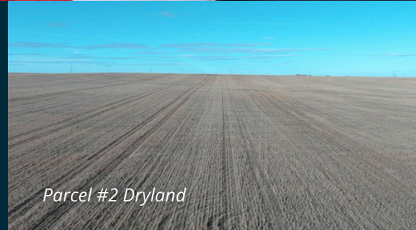
Parcel #2 Dryland