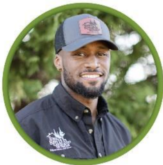
KADERO EDLEY REALTOR®

This 1.42± acre property in Pike County MS offers the perfect blend of peaceful country living with the convenience of nearby city amenities. Located just 3.5 miles from the heart of McComb, MS, this property provides quick access to shopping, dining, and schools while still enjoying a quiet, rural atmosphere. This tract is situated in a calm, close-knit community with a neighborhood watch program in minimal traffic and a safe, quiet setting making it ideal for your homesite or long-term investment. Whether you're looking to build your dream home or invest in a well-located piece of land, this 1.42± acre tract delivers a rare combination of convenience and peace. Give Kadero or Jake a call for your private viewing today!